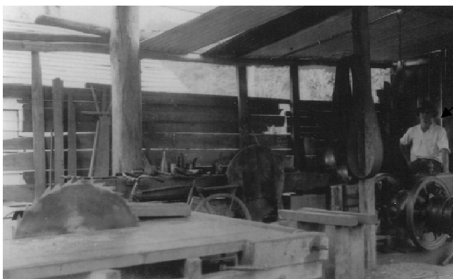
Grandad Burgess (Pop) Part of original saw mill. Ruskin Hornsby 6-10 hp motor [Billy]

Info from: Billy & Ken Burgess (Pop Burgess' grandsons) conversations with Glenda Parish 2010 -13 also from: Norm Foster's book " The Roof Garden Of Mackay" c.1985 page 67